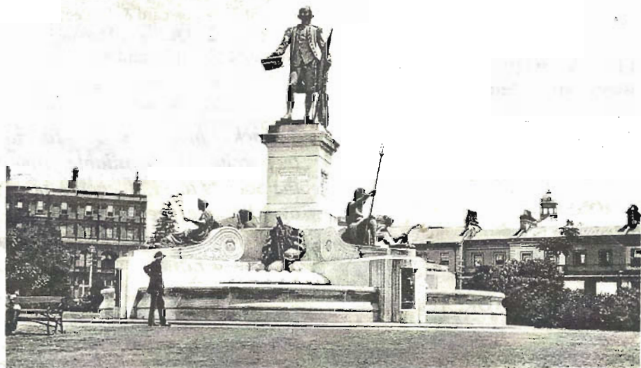
Governor Phillip's Statue, Palace Gardens, Sydney, N. S. W.

For the Collector of Postcards, Cigarette/Trade Cards and Ephemera