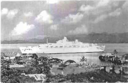
The Oriana entering Suva Harbour in Fiji

Though P & O had been part owners of the Orient Line since 1918, at the time the ship was under construction the latter's fleet was still operating separately from that of P & O, and was following traditional company custom of giving names starting with "O" to its ships and painting their hulls corn-yellow, whereas P & O's were white.