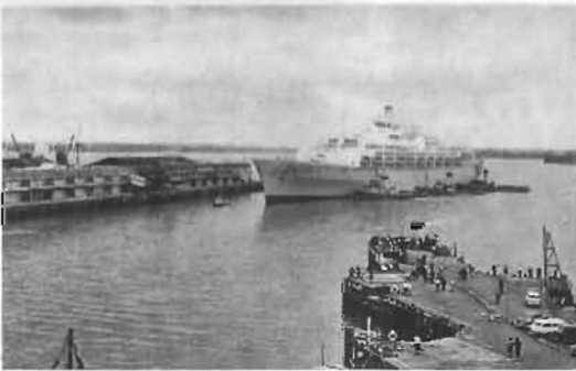
The Oriana coming alongside the passenger terminal at Princess Wharf, Auckland, NZ)

The post-war fleet included the Oronsay , Orcades and Orsova , and survivors of World War II, the Orion , Otranto and Orontes . So, the Oriana was intended to be operated under the Orient Line house flag. However, on 2. May 1960, the fleet was combined under the name of P & O - Orient Lines, so that they never actually operated as an Orient liner. She was given a corn-yellow hull, but in the mid-1960's she was repainted white along with her fellow "O-Boats", when P & O acquired the last shares in the Orient Line, and the company became simply P & O again.