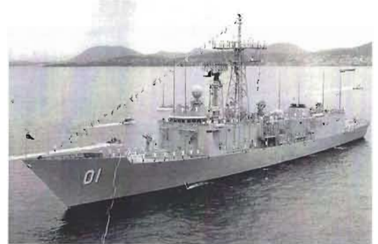
HMAS Adelaide was built in USA and commissioned in 1980 (Royal Australian Navy PC: Bicentennial Naval Salute 1988 - No.1)