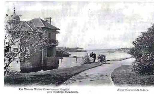
View down the Parramatta [River] (Kerry)

these men who were housed at the North Head quarantine Station. Not content with mere visits, she decided she would establish a camp for them at Yaralla, which she did in 1917. That simple settlement sheltered 32 soldiers and all cost were borne by Eadith Walker. The area was known simply as The Camp and consisted of pitched tents and the Norwegian Cottage that was fitted out as a workshop.